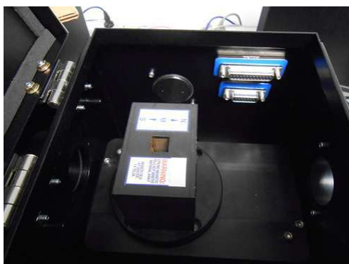
Fig. 1 : MCD accessory

MCD accessory consists of a compact 1.4T magnet (fig.1) that can be easily fitted into MOS-500 sample compartment. The magnetic shield of the standard MOS-500's photomultiplier is strong enough so high voltage is not affected by magnetic field. Contribution of natural CD is removed by a quick inversion of magnetic field polarity.